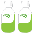
Two bottles of CLENPIQ (5.4 oz each)